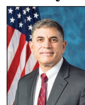
Congressman Andrew Clyde are residents of Jackson County and members of the Prince Avenue Baptist Church, where Congressman Clyde serves as

Presently, Congressman Clyde serves on the House Committee on Oversight and Reform and the Homeland Security Committee.