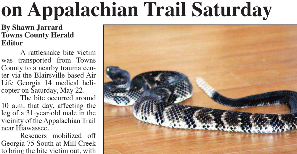
This Timber Rattlesnake was used to conduct a class on venomous snakebites and first aid for emergency responders at the Towns County Recreation and Conference Center on Jan.

According to the Georgia Department of Natural Re-