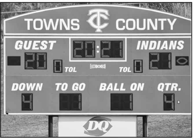
The Towns County scoreboard was appropriately set prior to Saturday's graduation ceremony for the Class of 2021.

crust pizza in the cafeteria. "You watched your last