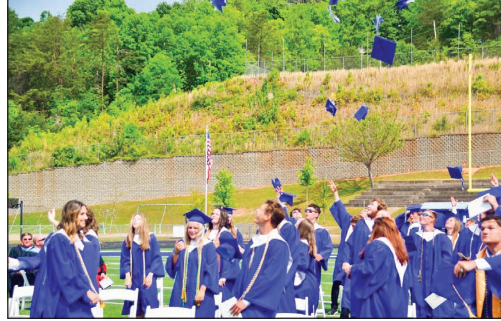
TCHS Class of '21 graduates were overjoyed to be completing their high school education last week by finally earning their diplomas.